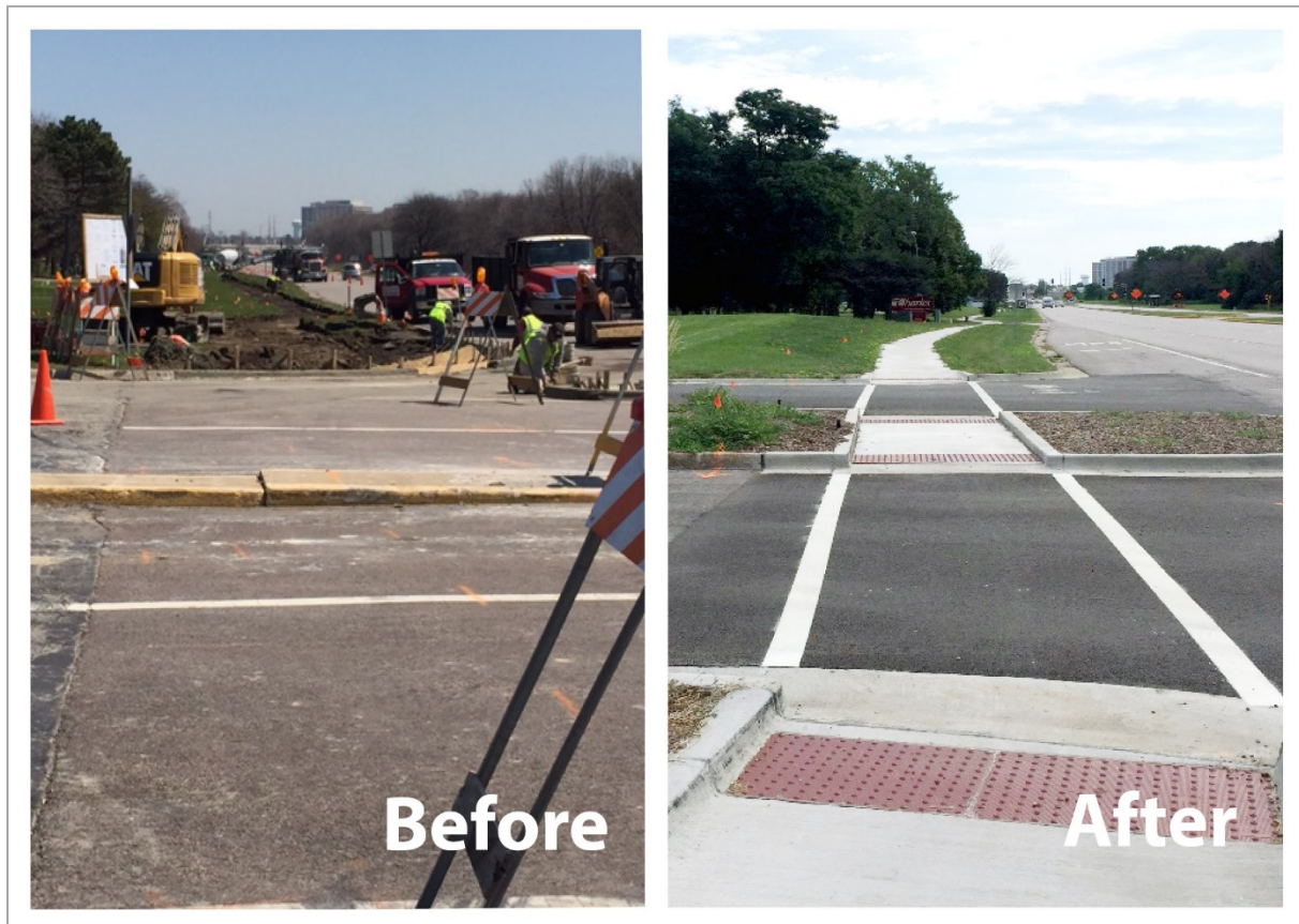
A sidewalk and crosswalk along a two-mile section of Golf Road in Rolling Meadows that is served by three Pace bus routes

served by three Pace fixed routes: #208, #575 and #606. By installing crosswalks, sidewalks, countdown pedestrian signals, and concrete pads for bus shelters, access between bus stops and office parks on this busy corridor has greatly improved, encouraging more employees to commute by transit. The project is based on recommendations in the Golf Road Transit and Pedestrian Mobility Study , completed with RTA Community Planning assistance.