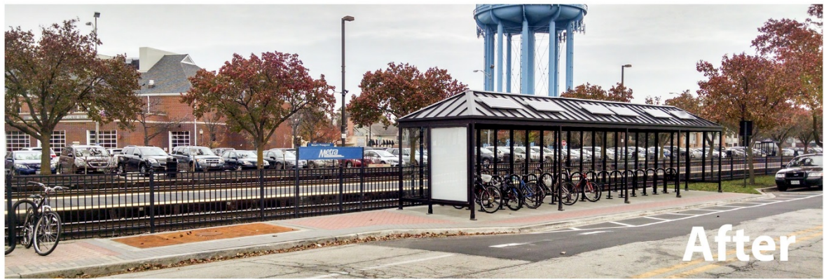
A new bicycle parking shelter on Prospect Avenue in Mount Prospect next to the Metra station platforms