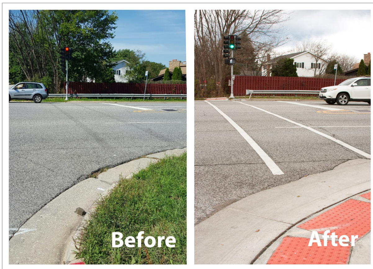
A new crosswalk at Harlem Avenue in Palos Heights provides better access to Pace's South Harlem route

The City of Palos Heights received funding through Access to Transit to improve access to Pace Routes #383 and #386, as recommended in the Harlem Avenue Corridor Plan , which was funded through the RTA's Community Planning program. The project consists of new sidewalks, crosswalk striping and countdown pedestrian signals at several locations along Harlem and Ridgeland Avenues. Pace Routes #383 and #386 serve a number of important destinations, such as Midway Airport, CTA and Metra rail stations, Toyota Park, and several major employers and shopping centers.