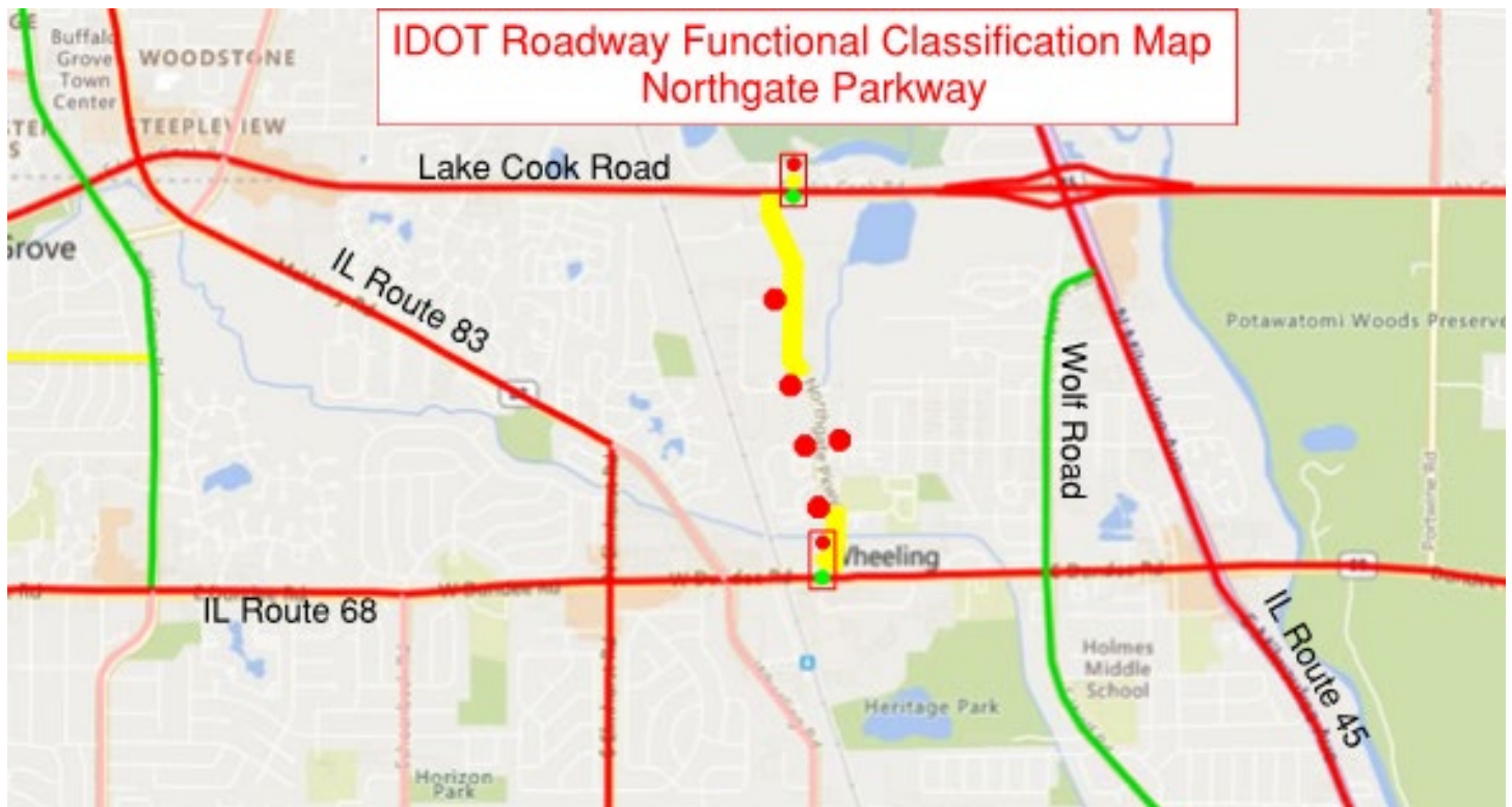
Color Scheme for Functional Classification