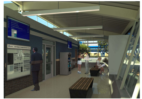
Passenger waiting area