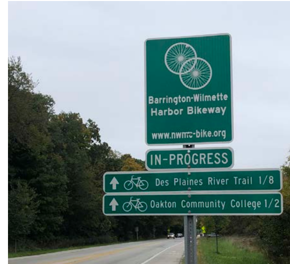
Existing signage in the NWMC region.

"Signage should be as simple and straightforward as possible. We planners and administrators care about jurisdictions and logos, but most cyclists don't."