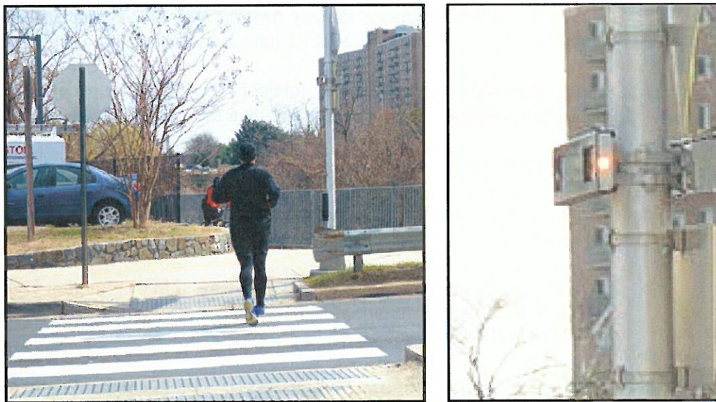
Figure 2. View of pilot light to pedestrian at shared-use path crossing with median refuge. Enlargement of pilot light at right.