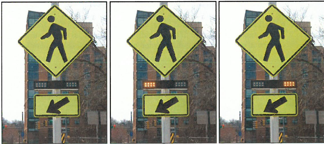
Figure 1. Example of an RRFB dark (left) and illuminated during the flash period (center and right) mounted with W11-2 sign and W16-7P plaque at an uncontrolled marked crosswalk.