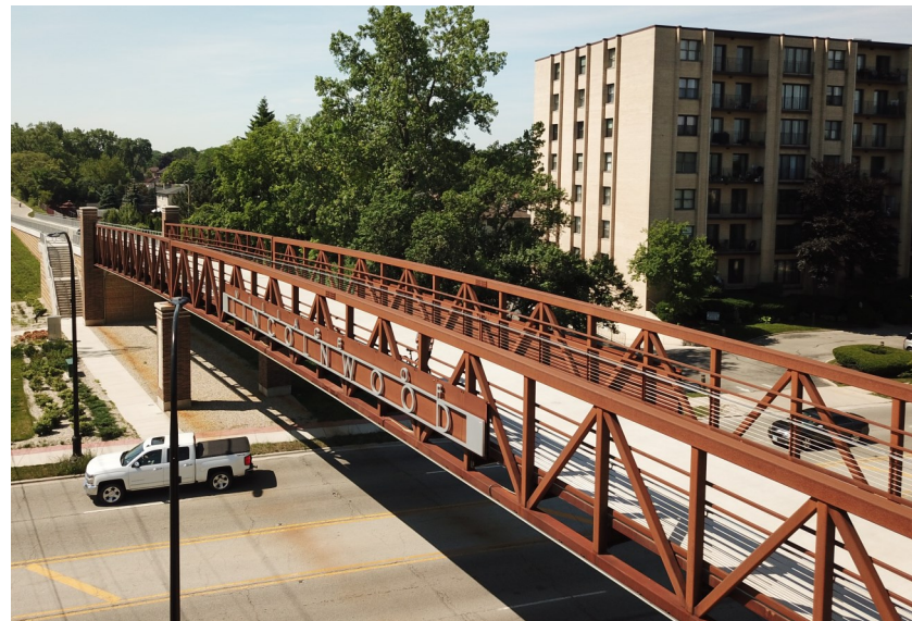
Village of Lincolnwood