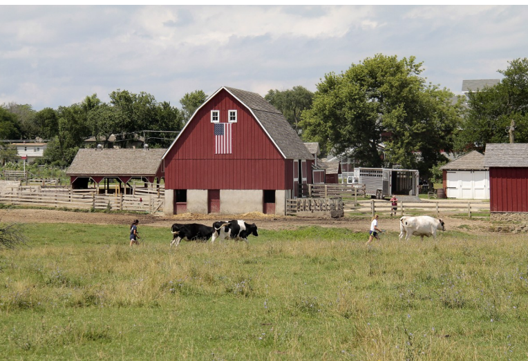
Village of Glenview

Inter-agency working groups comprised of staff from the RTA, CTA, Metra, and Pace have begun laying the groundwork for the transition to the Northern Illinois Transit Authority (NITA) this June, identifying timelines, key issues, and critical decision-making points for early NITA priorities. The RTA has established five working groups to address budget, fares, service, land-use, and rider information policy changes outlined in the NITA Act. Progress from early meetings of each working group was discussed at the February RTA Board of Directors meeting, and a presentation is available online. The RTA is seeking input from regional stakeholders, please contact RTA Government Affairs staff to share your perspectives on these issues.