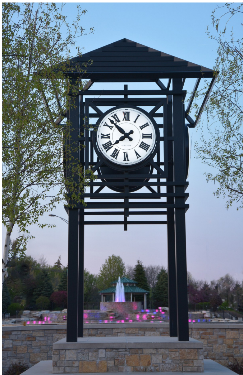
Village of Wheeling

May 6, 12:00 p.m.— Evaluation of the Legal Landscape Impacting First Responders