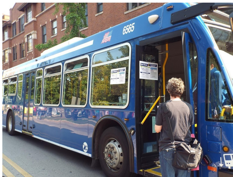
City of Evanston

Between September 2024 and June 2025, CMAP collected detailed travel behavior data from more than 3,500 households across the region. CMAP has published the Phase One dataset from its My Daily Travel household survey , marking a major milestone in a multi-year effort to better understand how northeastern Illinois residents move through the region. The dataset provides critical insight into daily travel patterns, mode choice, telework, transit use, and barriers to travel — and will inform CMAP's travel demand modeling, policy analysis, and long-range transportation planning efforts, including the development of the next Regional Transportation Plan.