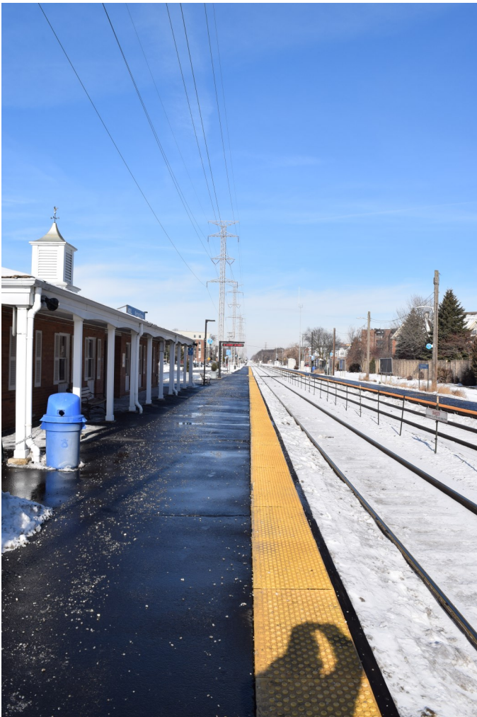
Village of Morton Grove