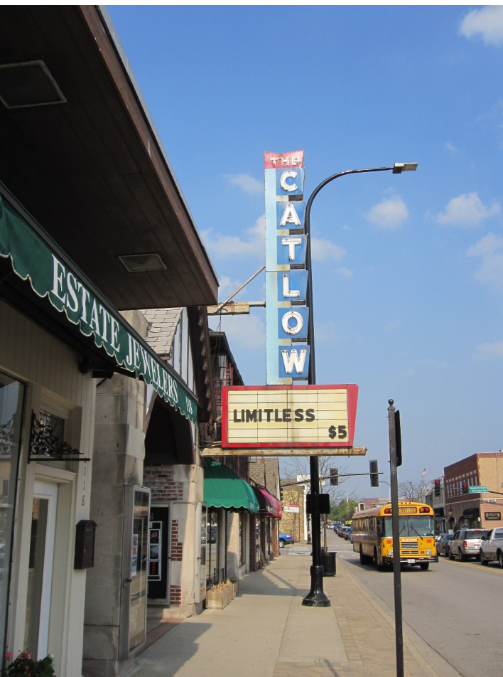
Village of Barrington

The Illinois Department of Transportation (IDOT) is seeking public input on a new study assessing the state's rail system. The study aims to gather information on current conditions, capacity issues, and safety challenges in order to create solutions and potential improvements to the system. Information gathered through the study will be used to develop a statewide rail plan, which is required of states in order to receive funding under the Passenger Rail Investment and Improvement Act. The study will also help inform IDOT's Illinois Long-Range Transportation Plan and contribute to the development of the state's overall transportation system. Comments should be submitted by Monday, June 14 through the project's online form or emailed to Illinois-RailNeeds@gmail.com . For more information, please see IDOT's press release or contact Paul Wappel, paul.wappel@Illinois.gov .