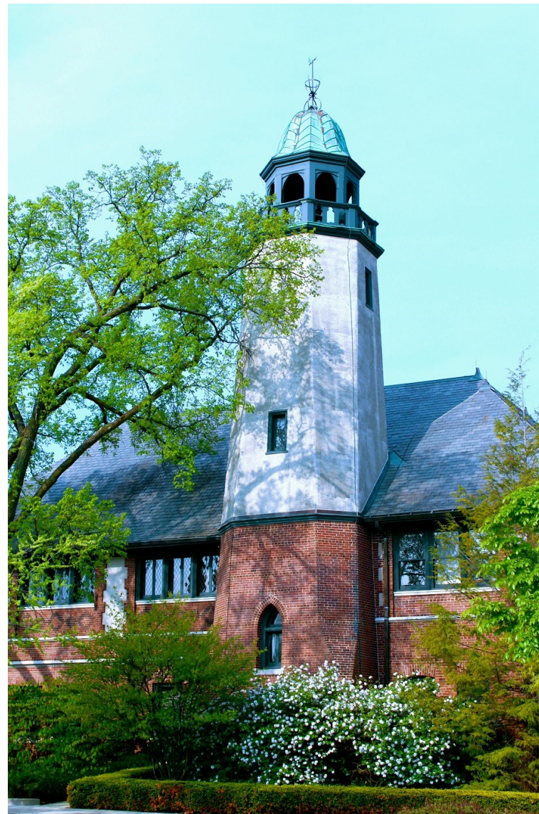
City of Lake Forest

The Illinois Department of Transportation (IDOT) recently announced the creation of a Safety Information Exchange Survey Form for local agencies and first responders to help IDOT better understand roadway safety issues. This Information Exchange will be utilized in collaboration with IDOT's numerous years of crash data so a more holistic set of information is analyzed and reviewed. IDOT is especially interested in communication and deeper knowledge in locations/sites in rural areas. Some examples of the information the Department is interested include road segments within a curve that have experienced several runoffs or intersections where near misses occur daily. To ease and expedite the exchange of information, local agencies are highly encouraged to communicate with IDOT via their online form . For more information, please see Circular Letter 2021-14 .