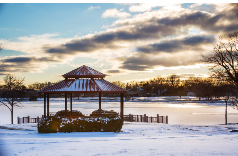
City of Des Plaines

Responses to the Northwest Municipal Conference's Multimodal Transportation Plan Annual Survey are due by Monday, January 10. The survey is designed to track the ongoing implementation of the NWMC Multimodal Transportation Plan and will be used to communicate multimodal investments made by communities across our service territory. Please take a few minutes to complete the survey online by clicking this link: https://survey.alchemer.com/s3/6611914/NWMC-Multimodal-Plan-Annual-Survey .