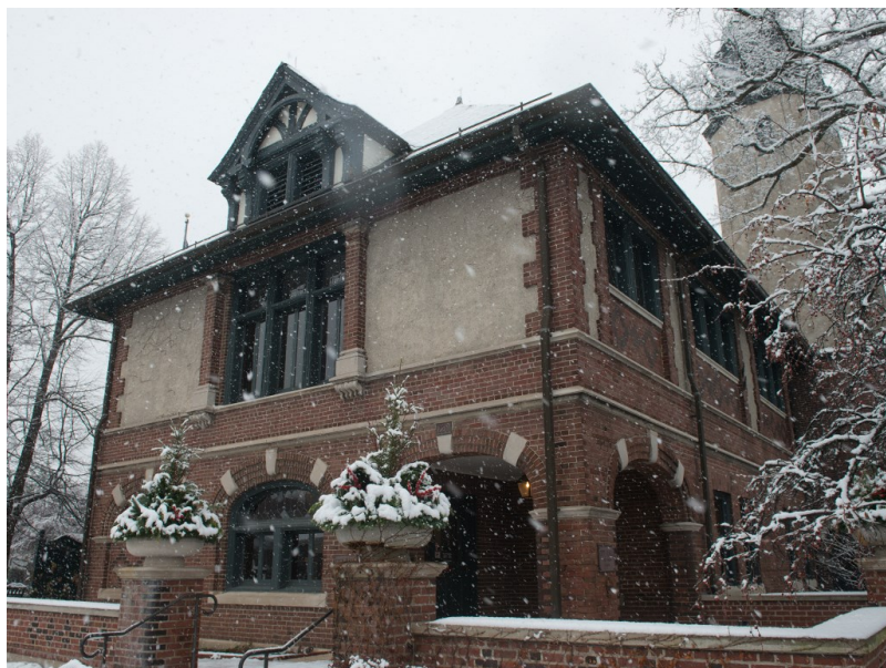
City of Lake Forest

To incentivize short trips and attract more riders, Metra customers can purchase a new $6 Day Pass beginning in February that will be valid for unlimited rides within three zones for a full day. Metra's popular $10 Day Pass good for unlimited rides on all Metra lines will continue to be offered; however, it will only be available on the Ventra app after January 31. For more information on fare changes and ticketing options please see Metra's press release .