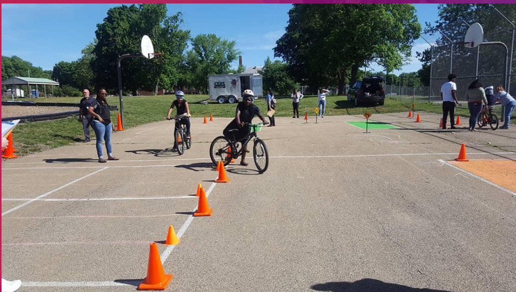
Bike rodeo and education