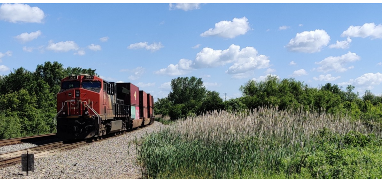
NMWC Staff Village of Hoffman Estates

If you have any questions about the RTP or questionnaire – or would like CMAP to present or attend a local event – please reach out to rtp@cmaphillinois.gov . Together, we can create a transportation system that works for everyone. And please help spread the word! CMAP has developed a promotional toolkit for your social media and newsletters, including images, sample text, and more .