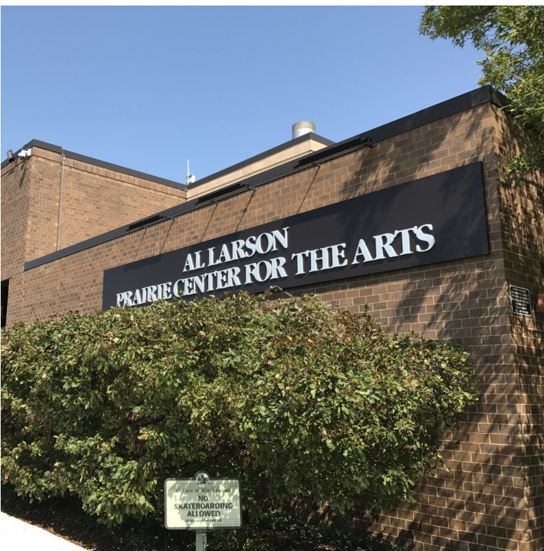
Village of Schaumburg