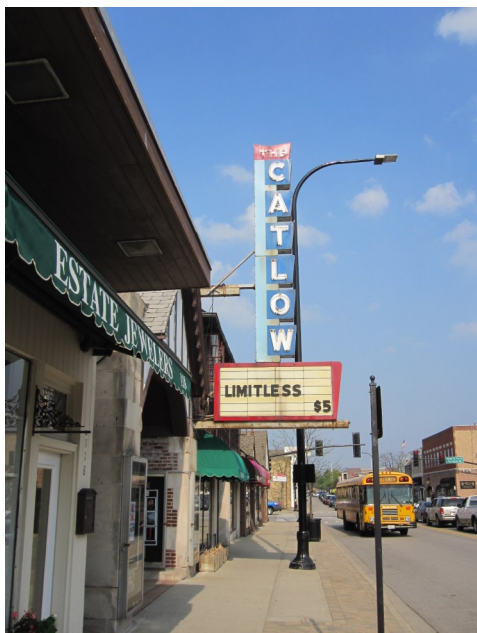
Village of Barrington