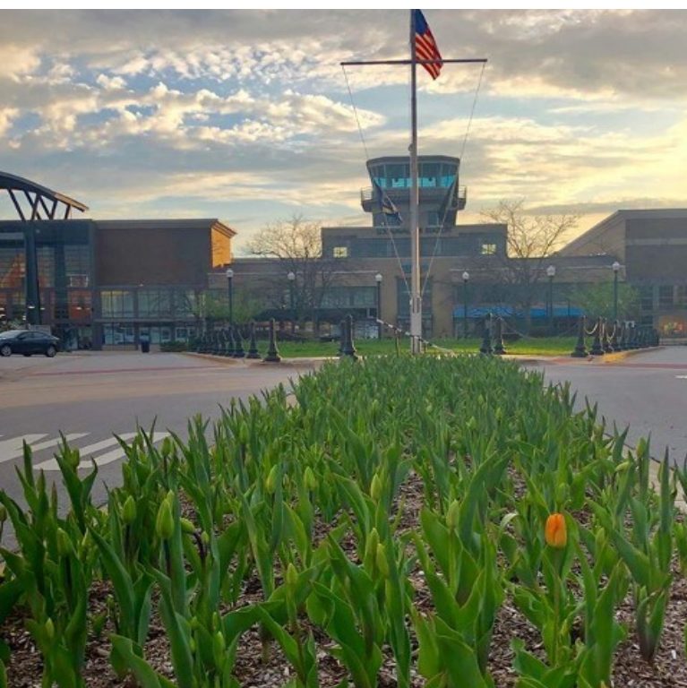
Village of Glenview

Recordings and training slides from previous sessions (including ADA and Title II of the ADA), along with additional information, is available by visiting CMAP's accessibility website .